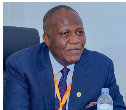
Felix Mutati, Zambia's minister of science and technology

Zambia's Minister of Technology and Science announced that the National AI Strategy will be officially launched on October 24, 2024, coinciding with the country's Independence Day.