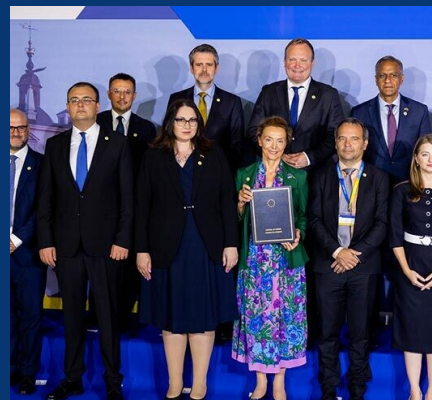
EU, US and UK representatives have signed a landmark AI safety treaty

The UK has signed an AI safety treaty with the Council of Europe, designed to protect human rights, democracy, and the rule of law from AI-related risks. The treaty commits member states to monitor AI advancements, implement regulations, and address issues like misinformation, algorithmic bias, and data privacy concerns. It complements the UK's Online Safety Act and invites other nations, including the US and Australia, to join this global initiative to ensure responsible AI development.