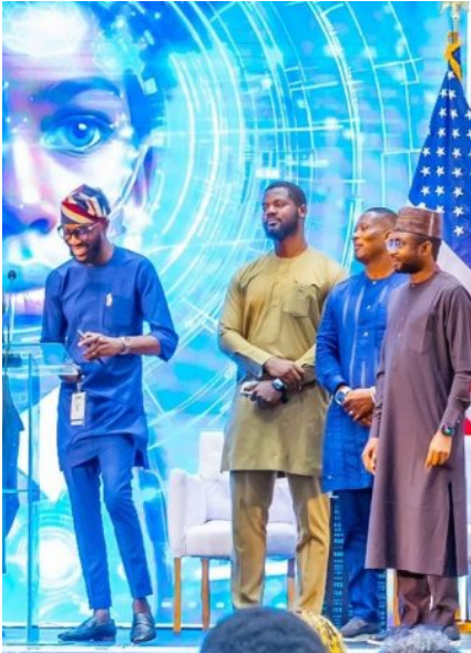
Nigeria's Minister of Communications, Innovation, and Digital Economy, Dr. Bosun Tijani