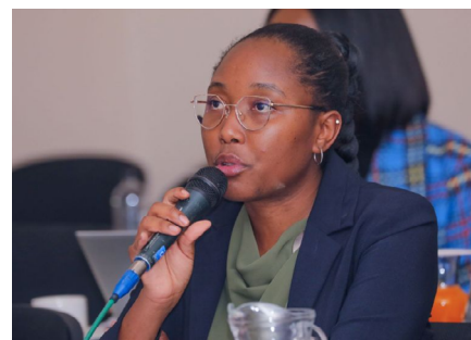
Namibia's Minister of ICT, Hon. Emma Theofelus

Namibia's Minister of ICT announced that the country's Data Protection and Cybercrime Bills are nearing completion, aimed at safeguarding citizens' personal data amid rapid technological growth. At the 8th National ICT Summit, she emphasised the need for a resilient framework to keep pace with digital advancements, promoting technologies for e-government, digital health, and education.