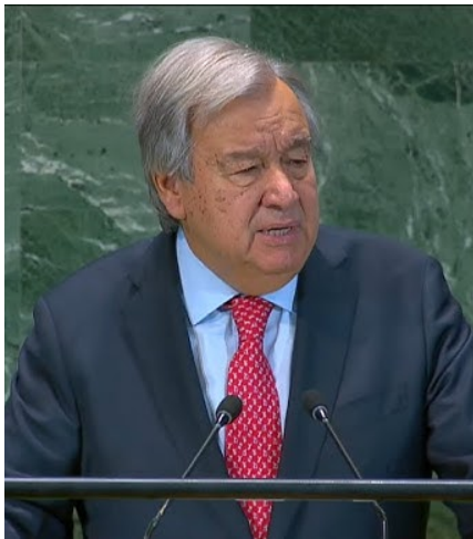
UN Secretary-General António Guterres

World leaders at the United Nations have adopted the “Pact for the Future,” a wide-reaching agreement aimed at transforming global governance to meet modern challenges. This historic Pact includes a Global Digital Compact and a Declaration on Future Generations, addressing a range of issues such as peace and security, climate change, and digital cooperation. It emphasises commitments to UN Security Council reform, nuclear disarmament, and the prevention of weaponizing emerging technologies. Additionally, the Pact supports sustainable development, financial reforms for developing nations, and the inclusion of youth in global decision-making.